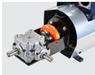
Integral mounting bosses guarantee alignment with gearbox and hydraulic mount