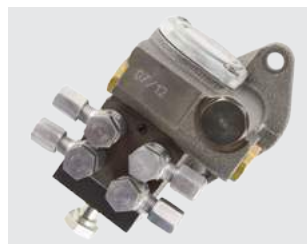
Automatic adjustment free mechanical oil pump