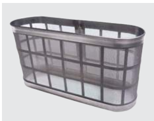
Washable stainless steel Inlet Filter for long filter life

Superior reliability and performance features built into every Masport pump