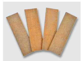
Heat stabilized Kevlar vanes machined to exacting tolerances